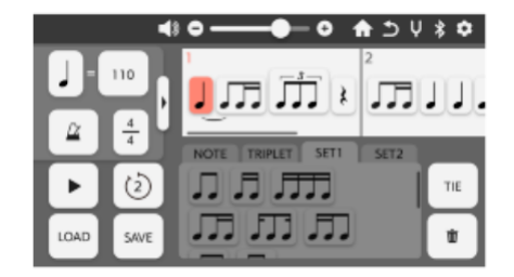
iOS - Rhythm Assistant

For more information or to pre-order, please visit with your Palen Music Center educational representative.