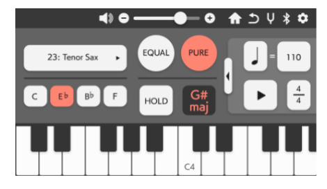
iOS - Remote Control