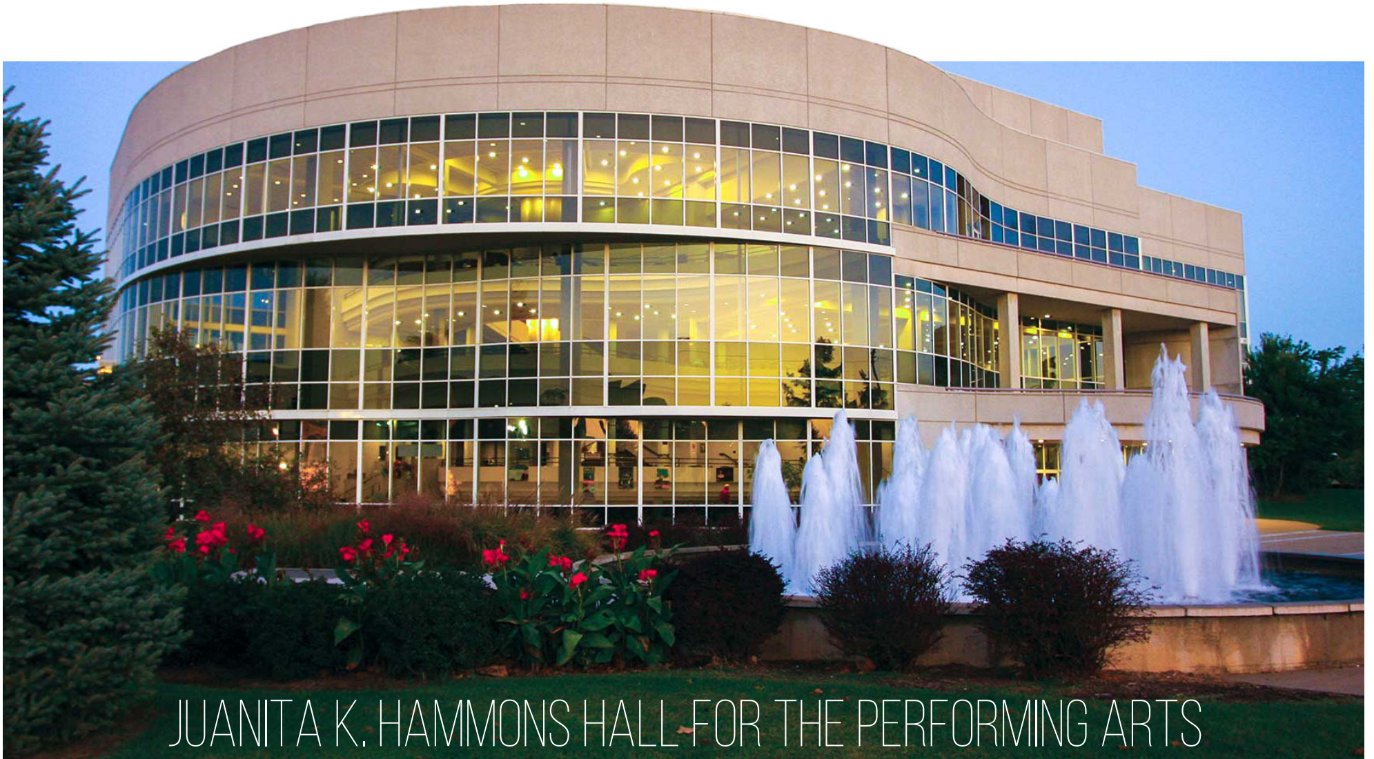
JUANITA K. HAMMONS HALL FOR THE PERFORMING ARTS

Welcome to the sixth-annual Palen Concert Clinic held on the campus of Missouri State University at the beautiful Hammons Hall for the Performing Arts. Each high school performing group will receive a 45-minute performance and clinic in a non-competitive environment. Entry fee is $150.00.