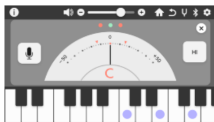
iOS - Tuner