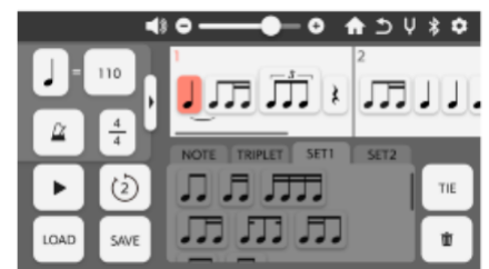
iOS - Rhythm Assistant

For more information or to pre-order, please visit with your Palen Music Center educational representative.