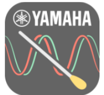
HD Assistant iOS App